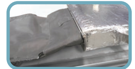
Sleeves air conveyor